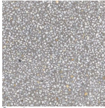
Cemento VP6002 ◊ T078