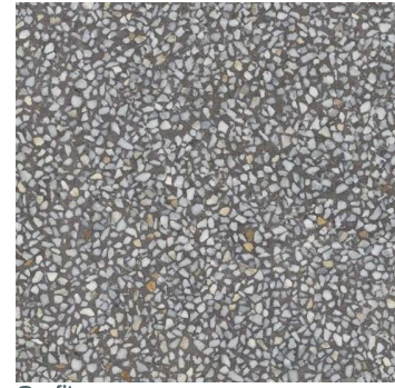
Grafito VP6004 ◊ T078